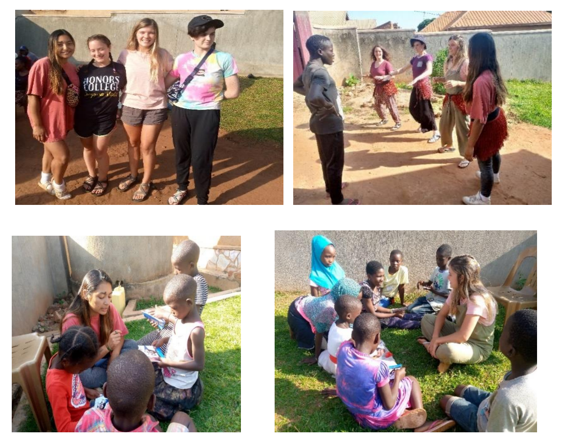
Students from Emporia State University with children at Edukey - Gangu

a. Gangu – Wakiso district. Here the students had an interaction with the children of Future Pride Nursery and primary school. The students did teach in class and played with the children out side. Being their first time teaching in Africa, they did experience a number challenges including the language, culture, curriculum and environment of learning.