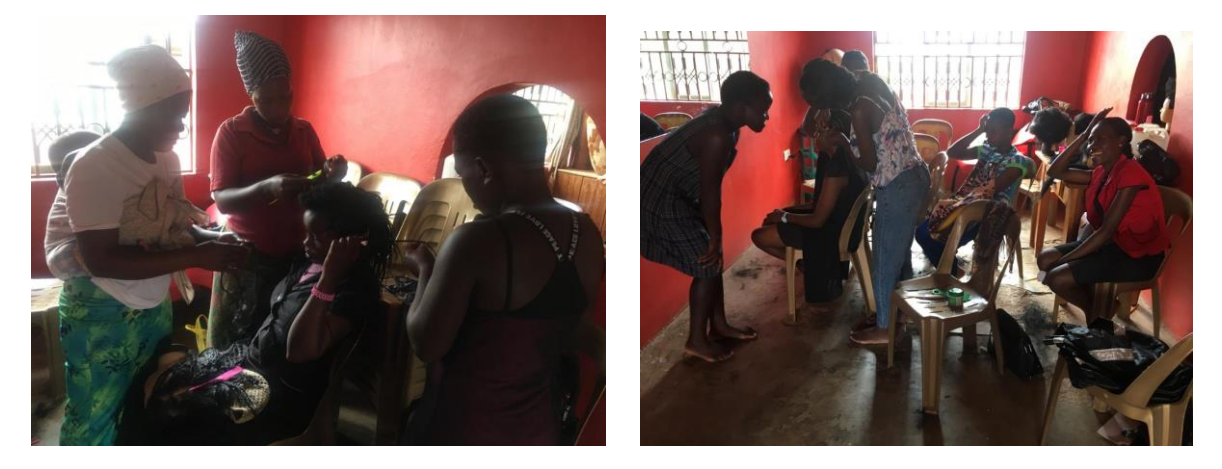
Women from the community training in hair dressing

Community members who did not have an opportunity to get hands on skills are being empowered with such skills that can help them to become self-employed and earn something for their living. Hair dressing training is conducted at Edukey centre among women and girls who dropped out of school. This skill is helping many women to earn a living and support their families with essential domestic needs. The year ending a total number of 48 community members have benefited in the skills training.