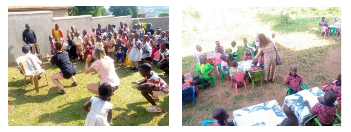
Students from Emporia State University at Edukey Community school - Mukono