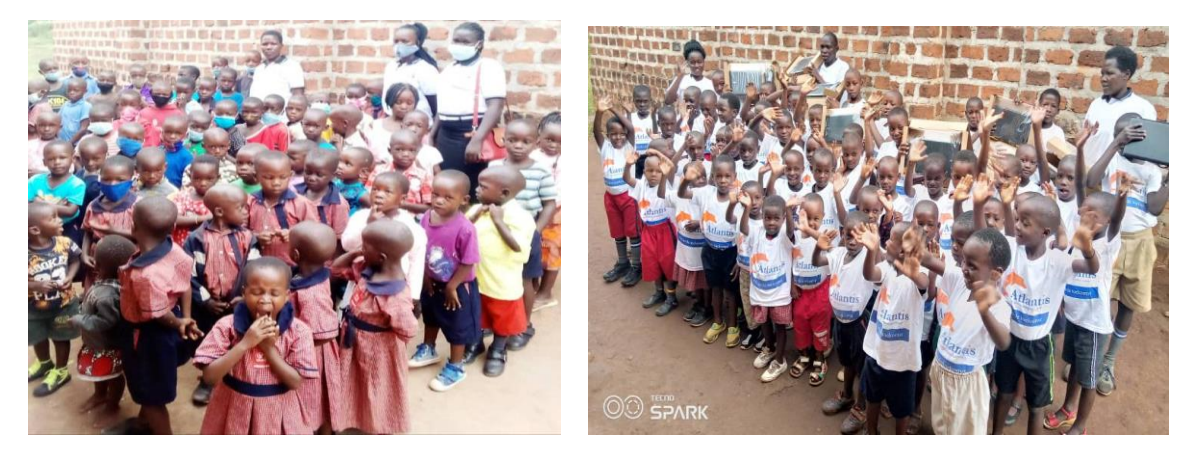
The children of Edukey Community school – Mangaliba – Mukono district