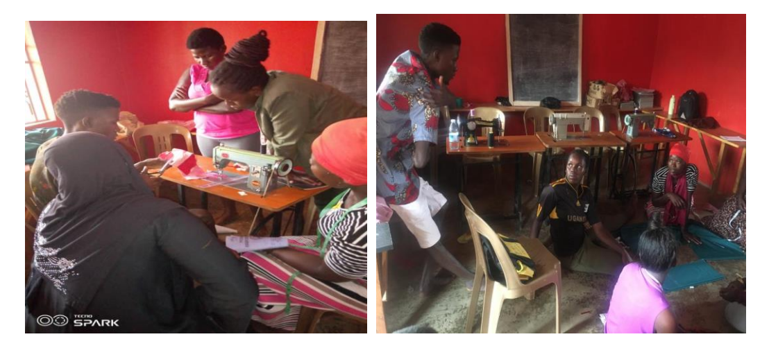
Women from the community training in tailoring