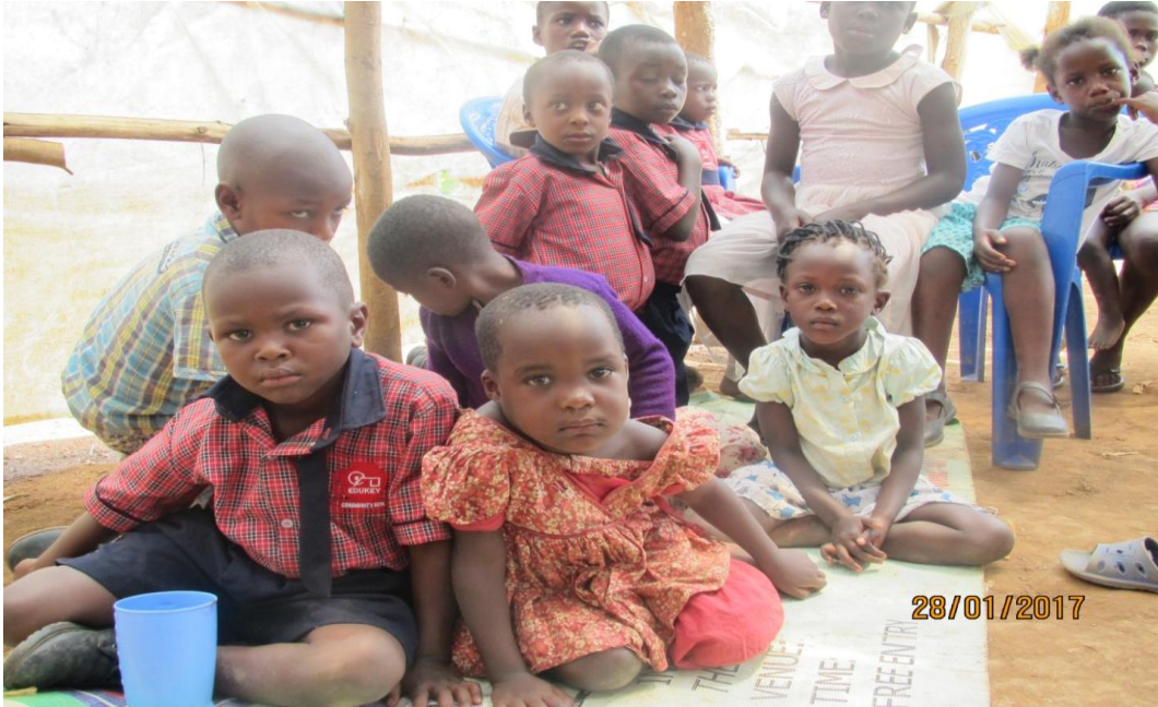
The prospective children enrolled for baby class