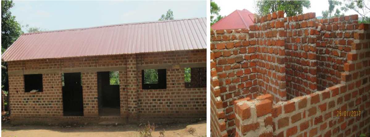
(L-R) Classroom block under construction and toilet

Edukey organization supports the construction of a three classroom block and toilet. The block is to accommodate the children in the three classes ie Baby, Middle and Top classes respectively. When the block is completed will accommodate more children. The construction of a toilet is equally supported by the organization.