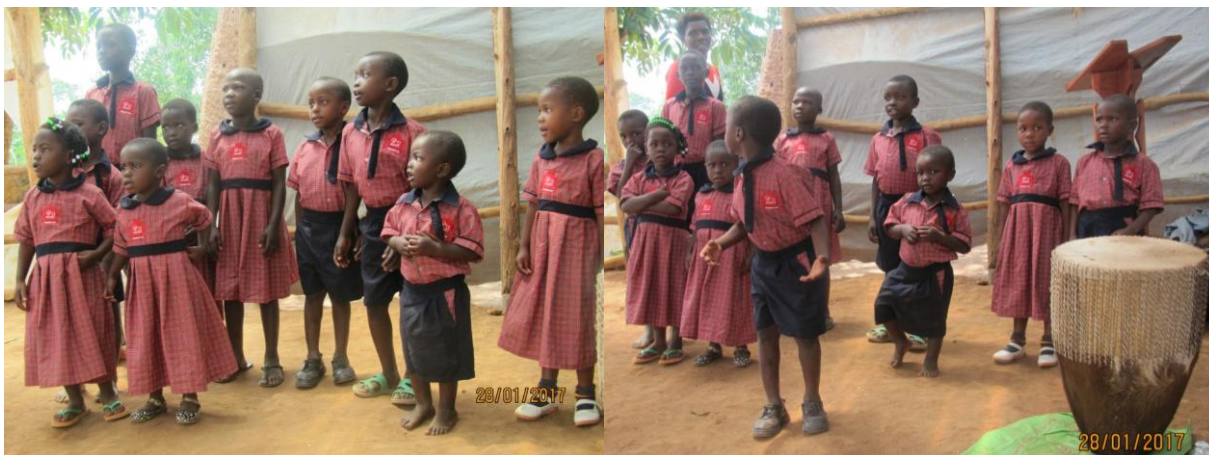
Edukey children singing school