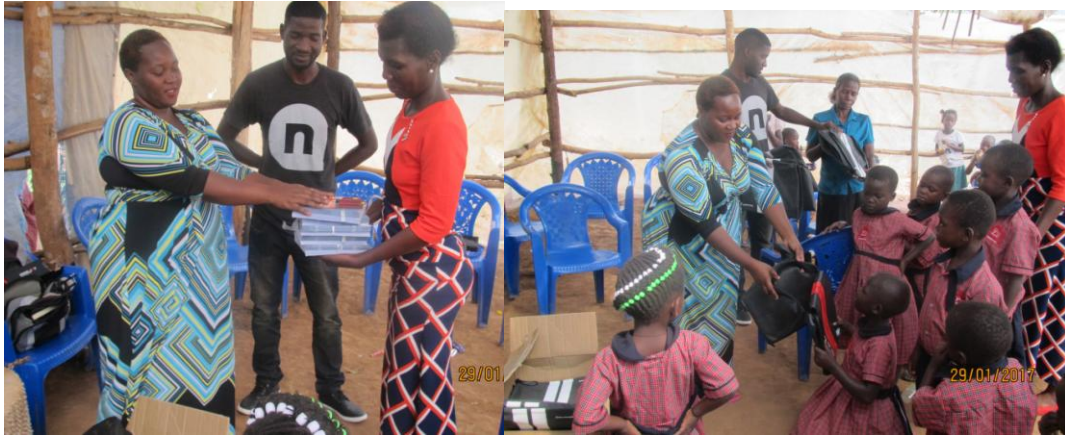
Barbra distributing scholastic materials and bags to teacher and children